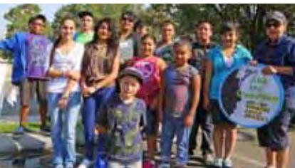
Ochoa Middle School students present YSPP's action steps at a 'Walk About to Talk About Suicide Prevention' event in Pasco.

Classroom to Community. In the three counties with the highest rates of suicide, school professionals and mental health providers are identifying students as highest risks for suicide and getting them into treatment. These collaborations play a critical role, impacting dozens of youth in crisis in Cowlitz, Yakima and South Pierce counties.