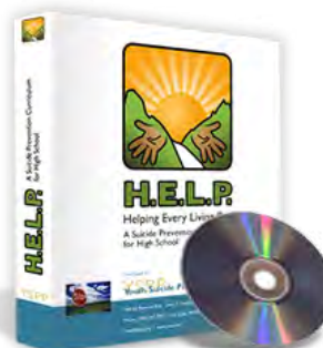
YSPP's H.E.L.P. curriculum for high school health classes.

Thanks to your generous help, YSPP offers resources for the well-being of young people, connecting schools, parents and communities.