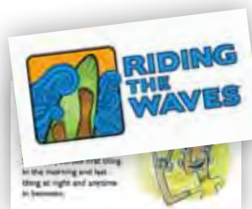
YSPP trains teachers to use 'Riding the Waves,' our 5th grade curriculum.

YSPP training continues to grow. In 2012, we delivered 329 trainings. We look forward to guiding teachers, counselors, coaches, community staff and youth leaders to collaborate and learn from each other how to prevent youth suicide.